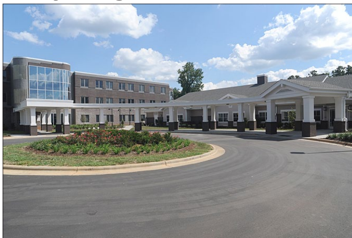
Luke Thompson Exterior shot of hoptel (left side) and hospice (right side).

• The six-bed hoptel provides temporary lodging as a courtesy to Veterans who live more than 50 miles away and are on the campus receiving tests and procedures, Compensation and Pension exams or related procedures.