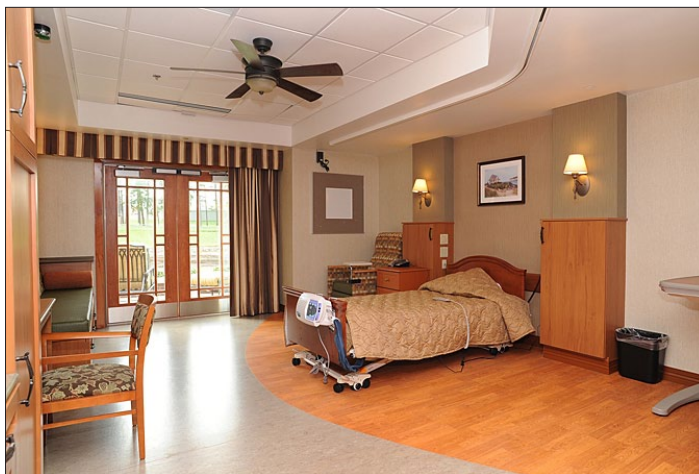
Luke Thompson Hospice private room with bath.