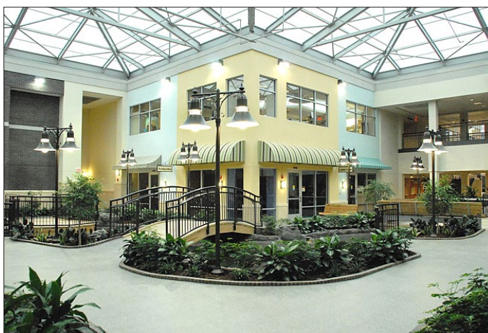
Luke Thompson Main Street atrium area.