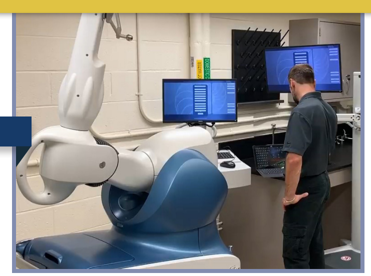
A MAKO Technician readies MAKO Robotic Arm Interactive Orthopedic System (RIO) for use. On Sept. 25, 2019, the DVAHCS became the first VA Healthcare system in the country to receive the RIO. The robotic arm will assist orthopedic surgeons in hip, knee and joint replacements.

A CT scan of the affected joint is uploaded into the MAKO System software, which creates a 3D model of the joint. The surgeon uses the model to map a plan for the joint replacement. The relationship