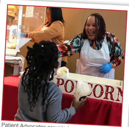
Patient Advocates provided popcorn to staff and Veterans in recognition of Customer Service Week at the Central Virginia VA Health Care System in Richmond.