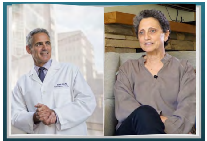
During National VA Research Week, VA highlighted some of the exceptional researchers, including two individuals from VISN 6 who continue to improve the lives of Veterans and all Americans.