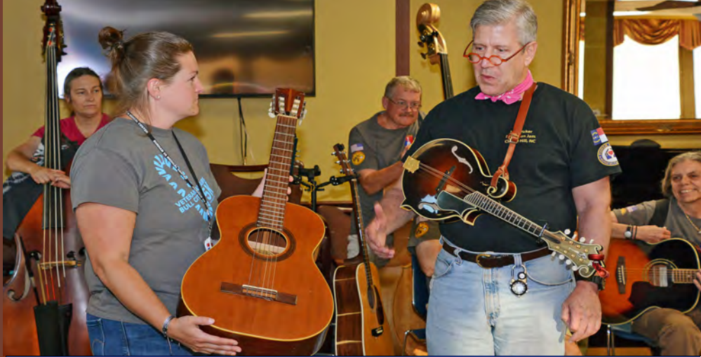
Music therapy programs, including Guitars for Vets, have been a vibrant part of the Durham VA and other VA medical centers in the VISN and throughout the nation.