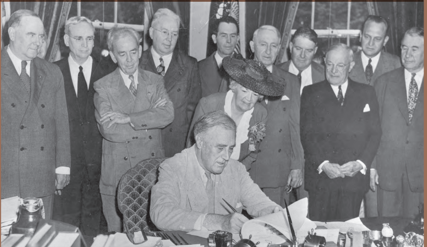
Franklin Delano Roosevelt signs the Servicemen’s Readjustment Act of 1944, which eventually became known as the GI Bill.