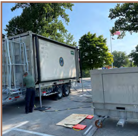
The Salem VA C-FORTS unit sits on a transportation trailer, ready for unloading.