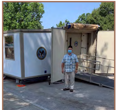
The Salem VA C-FORTS unit completely assembled.