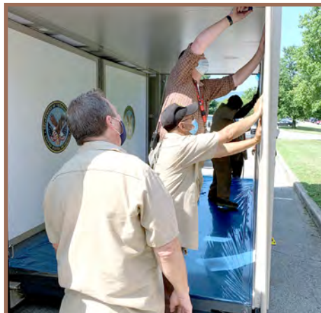
The Salem Emergency Management Team secures the C-FORTS outer wall.