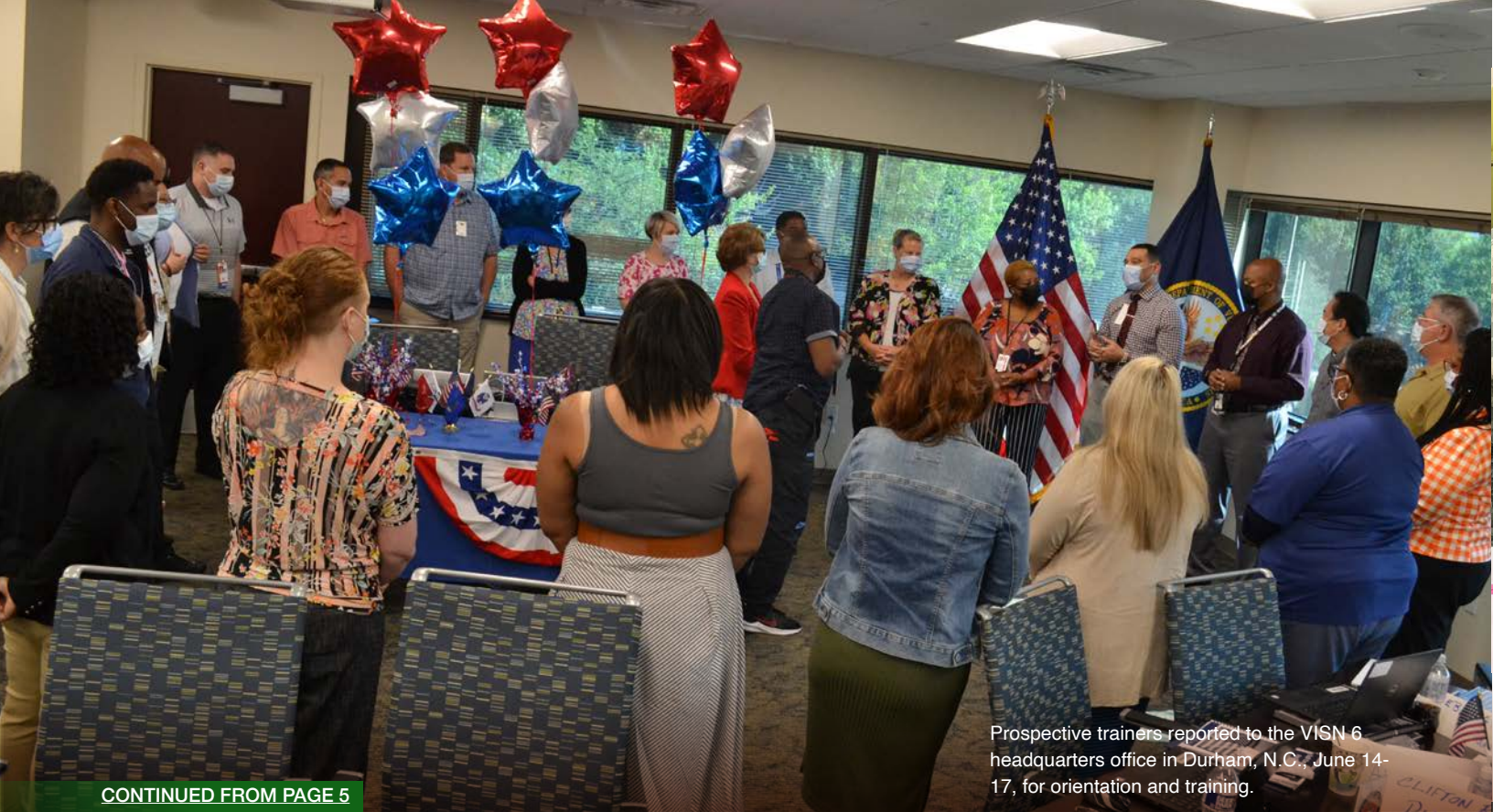
Prospective trainers reported to the VISN 6 headquarters office in Durham, N.C., June 14-17, for orientation and training.