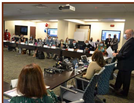
Trainers are offering an intense course on military culture called "Tour of Duty."

Over 10 years, the team put together a comprehensive curriculum covering military history, military bearing and traditions, the oath to serve, and the experience of military families; the ones our troops came from, as well as the ones they made for themselves. The course draws parallels between civilian federal service and military service, while also distinguishing civilian service from the grave risk