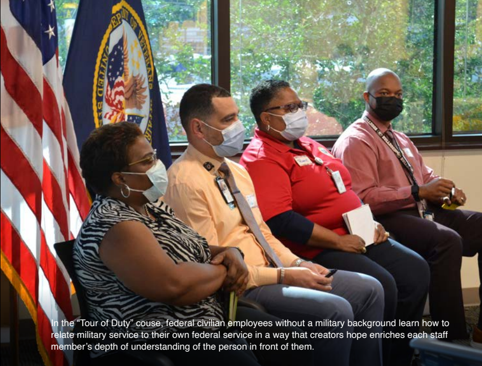
In the "Tour of Duty" course, federal civilian employees without a military background learn how to relate military service to their own federal service in a way that creators hope enriches each staff member's depth of understanding of the person in front of them.