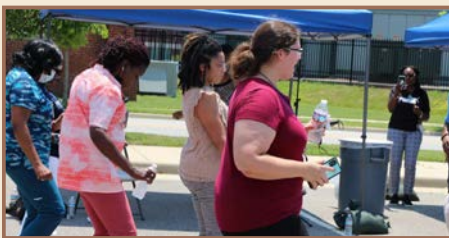
Staff endured the heat, dancing to various line dancing songs