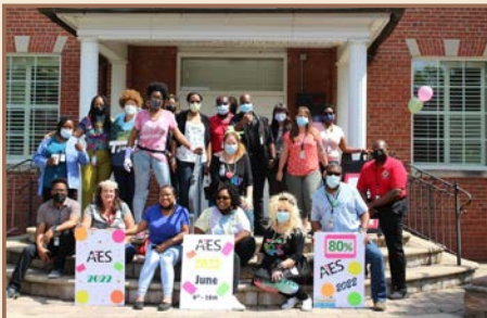
Organizers and participants of AES week

Hampton VA Medical Center (HAM-VAMC) kicked off All Employee Survey (AES) Kickoff Week May 31. Hampton staff members were treated to various events throughout the week to encourage engagement and participation. The AES anonymously surveys VA staff to discover areas of improvement. Leadership in each VA facility use the tool to implement changes to programs and operations.