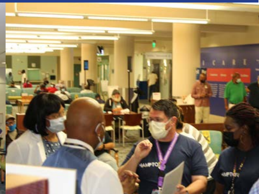
LEFT: Hampton VAMC proudly hosted its first-ever VA Mobile App Fair June 7. MIDDLE: Special T-shirts were made for the occasion. RIGHT: Hampton VAMC personnel worked to educate Veterans as well as staff on the value of the mobile apps on offer.