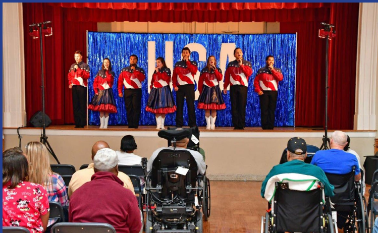
2018 Re-Creation – Cast members from the Re-Creation stage show entertain our Veterans.

Every year during the week of Valentine's Day, the Department of Veterans Affairs (VA) observes National Salute to Veteran Patients. This salute is a way for our community to honor and express its gratitude and appreciation to our inpatient and outpatient Veterans. In Fayetteville, our community partners and service organizations are so supportive that we hold a variety of activities throughout the month of February. From the thousands of Valentine's Day cards to the special visits (Fayetteville Marksmen, Re-Creation stage show, Tar Heel Quilters Guild), luncheons, bingos and gift bags, our community partners outdid themselves showing their support, admiration and respect to our Veterans. Thank you to all those who participated in this year's National Salute to Veteran Patients.