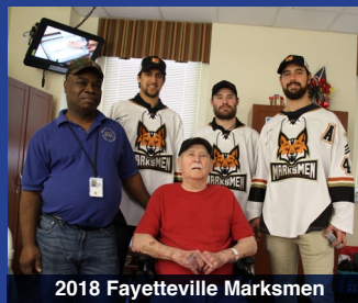
2018 Fayetteville Marksmen