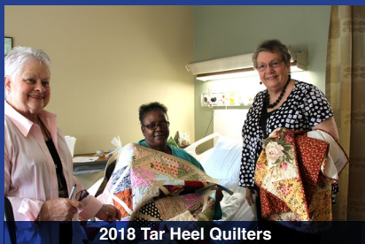
2018 Tar Heel Quilters