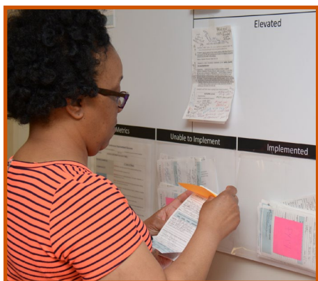
SeContinuous Improvement Boards have been successfully implemented in the Salisbury Health Care System.

CI Boards have made a positive impact throughout the Salisbury Health Care System, VISN 6 facilities, and VHA.