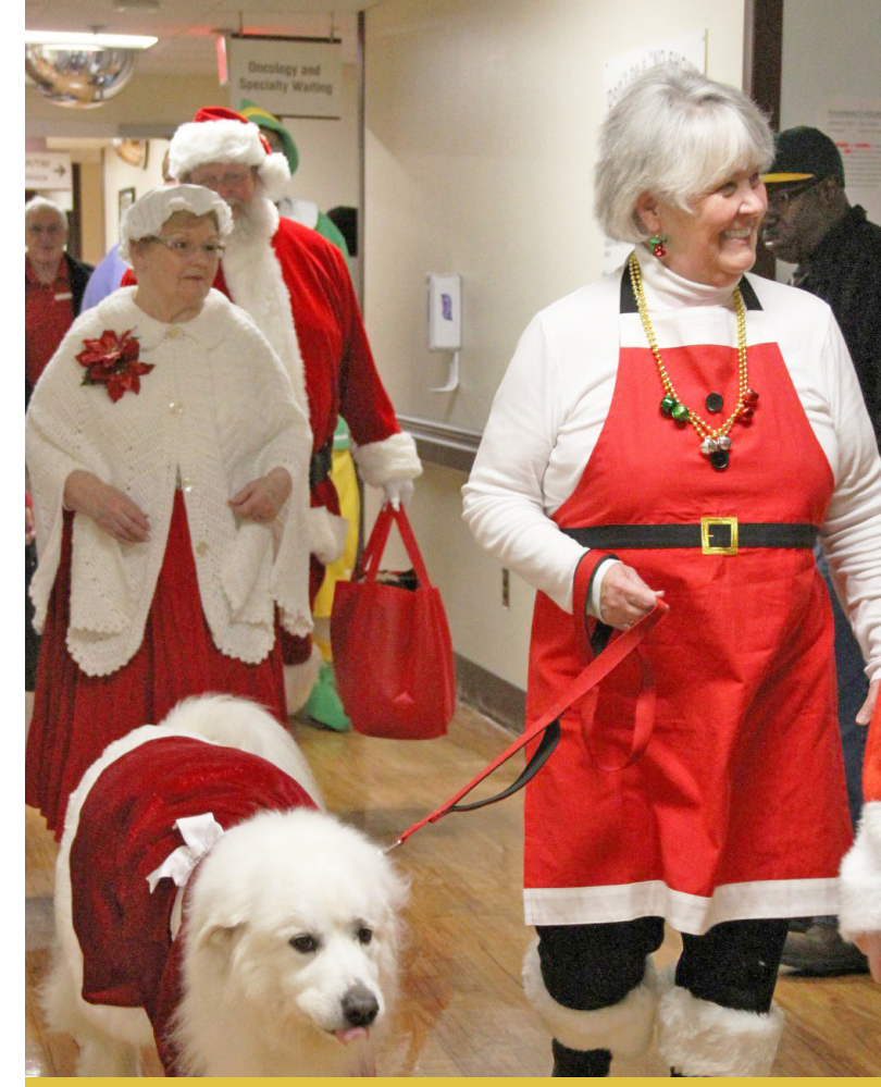
ABOVE PHOTO) Santa Paws (AKA Ghost) and troupe at the Fayetteville VAMC

The facility also sponsored events during the holiday season, including a gospel concert, room-to-room caroling by students and a church choir, a Christmas luncheon and bingo were just a few of the events held throughout December. Sponsored events by local schools, military personnel, and volunteers made the holiday season merry and bright for our Veterans.